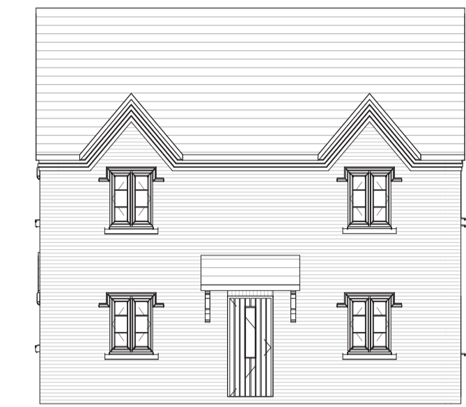
5 Side Elevation 2 1 : 100