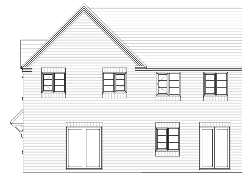
3 Rear Elevation 1 : 100