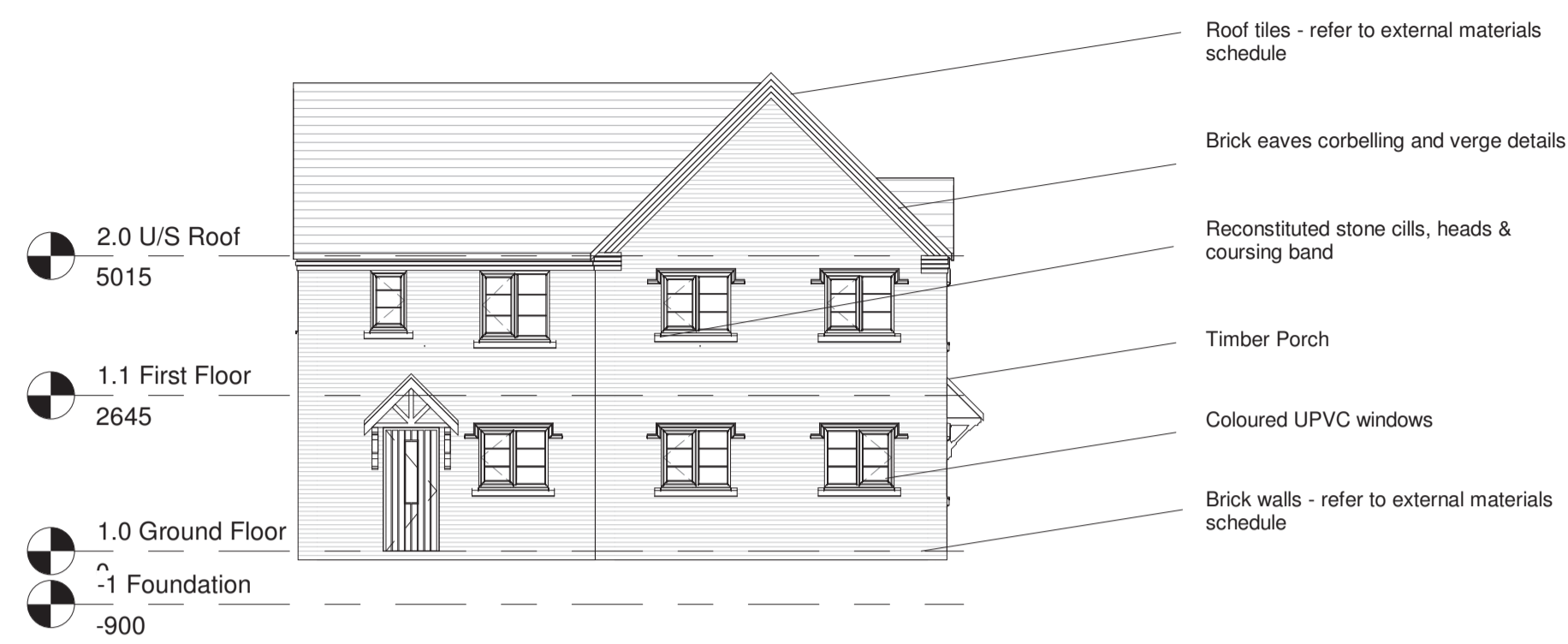
6 Front Elevation 1 : 100