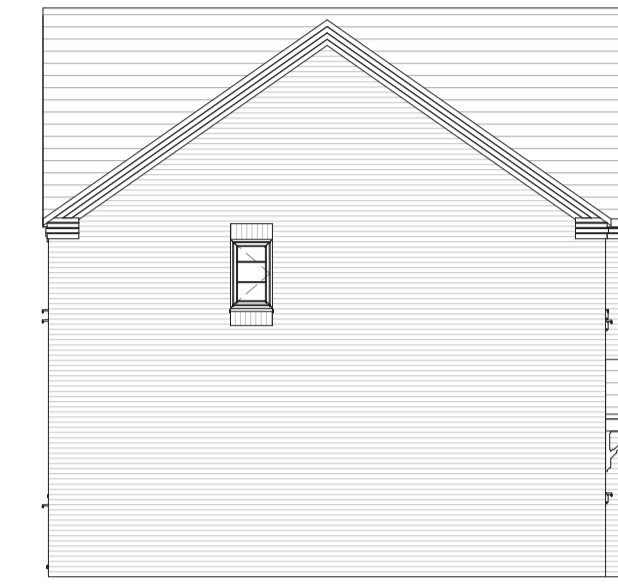
4 Side Elevation 1 : 100